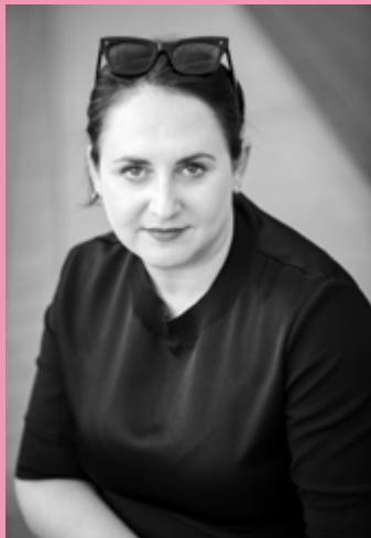
Nino Haratischvili, festival guest of honour