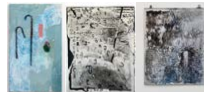
From left to right: - Les amoureux - Untitled