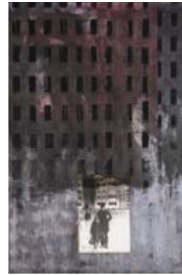
Untitled, serie "Suburb"