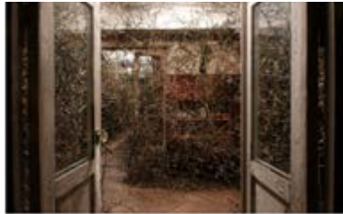
To Protect My House While I'm Away © Nika Kutateladze

NIKA KUTATELADZE Installation, Photography Galerie Berthet-Aittouarès