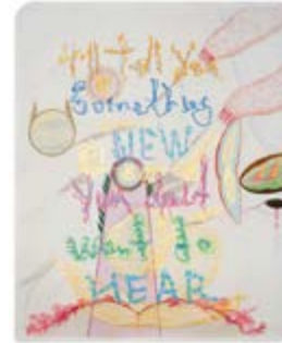
Authentic Behaviour © Maia Naveriani

MAIA NAVERIANI Drawing, Installation Espace des femmes - Antoinette Fouque