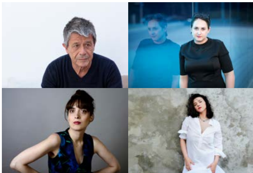
Credits from left to right

Odéon - Théâtre de l'Europe Duration: 1h45